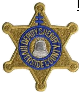
Sheriff's Star with Velcro Hook Backing